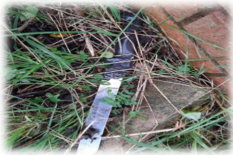
Pictured: Large knife hidden in grassland

Officers frequently deploy across the ward areas and participate in National weeks of action to raise awareness of knife crime, associated criminality and to ensure knives and other weapons are not being stored or hidden in open spaces.