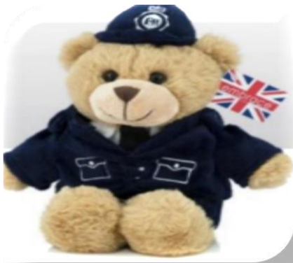
Pictured: Bobby the Police Bear

PCSO's across all ward areas have been actively engaging with local primary schools, to deliver class lessons, assemblies and to introduce 'Bobby' as part of the 'Talk to the Bear' project.