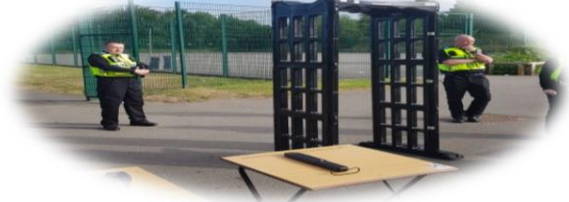
Pictured: NPT officers with knife arch at Co-Op Academy, Burmantofts.

In addition to weapons sweeps, NPT officers deploy the knife arch to schools, to check young people are not carrying knives.